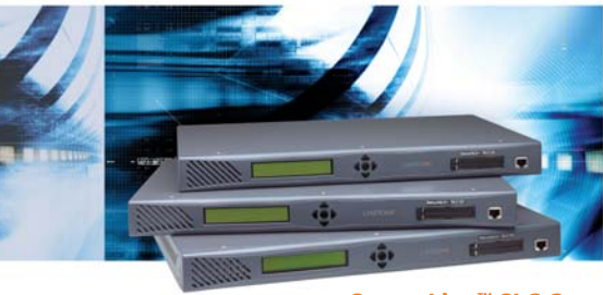
SecureLinx™ SLC Console Managers