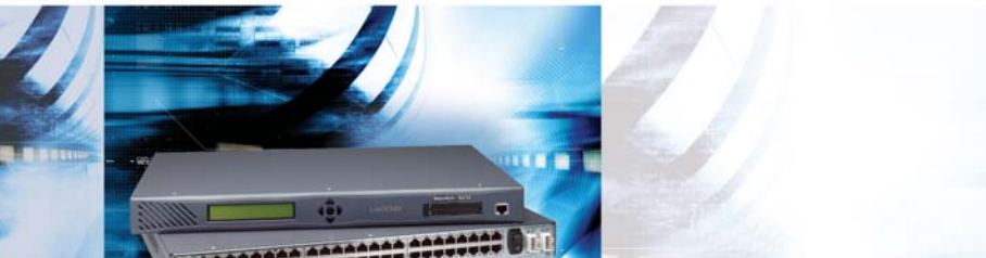
SecureLinX™ SLC Console Managers