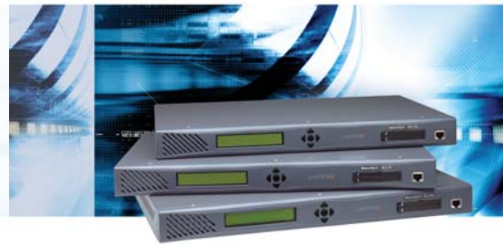
SecureLinx™ SLC Console Managers Quick Start Guide