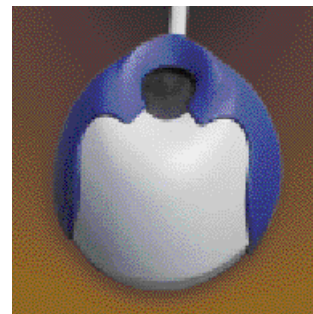
MT Digit Fingerprint Reader